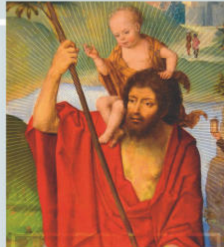
ST. CHRISTOPHER MAGALLANES