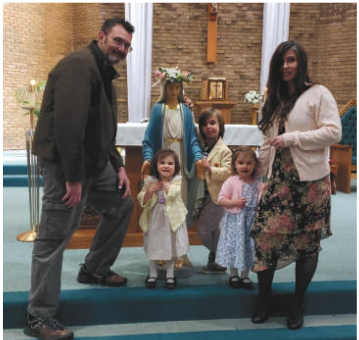
The Findysz Family