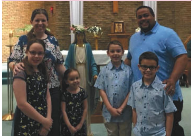
The Mercado Family