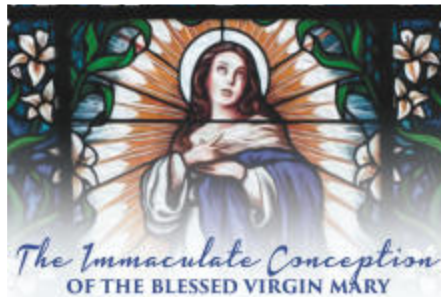
The Immaculate Conception OF THE BLESSED VIRGIN MARY

After a short prayer service, several priests will help us celebrate the Sacrament of Reconciliation. All are encouraged to use this opportunity of prayer, reflection, and penance as a part of the journey towards and preparation for Christmas. As you prepare for the Sacrament of Reconciliation, spend time in prayerful reflection with an examination of conscience, to help recall sins and personal areas in need of spiritual growth.