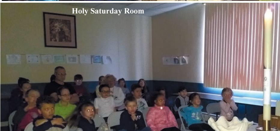
Holy Saturday Room