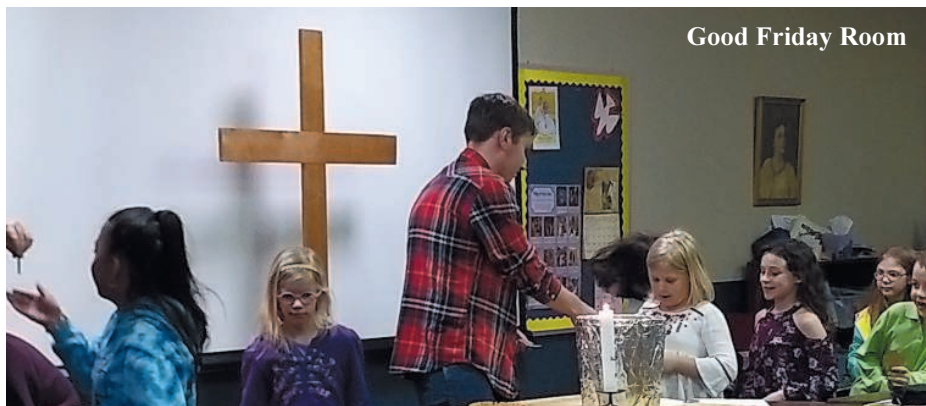
Good Friday Room