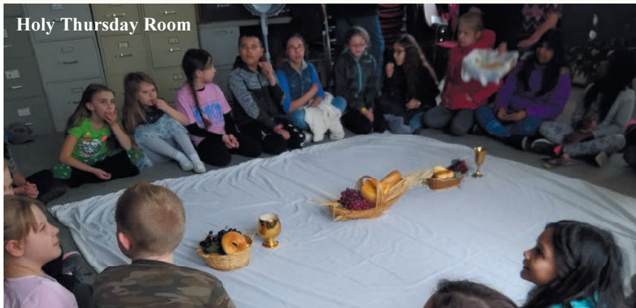
Holy Thursday Room

Children's Names, birthdates, grade/level (K-8), needs: